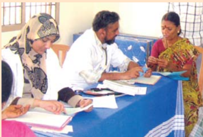
Unani physicians of the Council's Regional Research Institute of Unani Medicine (RRIUM), Chennai attending to patients at the free health camp held in Tondiarpet, Chennai on 29 August.

T he Regional Research Institute of Unani Medicine (RRIUM), Chennai functioning under the Central Council for Research in Unani Medicine organized two free health camps, one at Tondiarpet on 18 August, and the other at the Center of Unani Ilaj Bit Tadbeer, Puduvoyal Village, Gummidipoondi on 29 August.