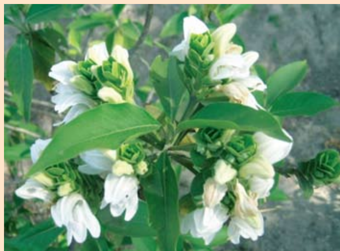
Aroosa ( Justicia adhatoda L.)

– Latex is applied locally to draw out spine from the body; Aru ( Prunus persica (L.) Batsch.) – Leaf paste is given for worm infestation; Banafsha ( Viola pilosa Blume) – Decoction of flowers is given for common cold; Barmi ( Centella asiatica (L.) Urban) – Leaf paste is given for vertigo; Bhamolan ( Solanum nigrum L.) – Cooked leaves are given for pedal oedema; Bhilmora ( Rumex hastatus D. Don) – Fresh leaves are rubbed for healing of cracked palms; Chhapa Ghans ( Adiantum sp.) – Powder of frond is sprinkled on prolapsed uterus in cows; Chitta ( Plumbago zeylanica L.) – Root paste is applied on piles and ringworm; Guiral