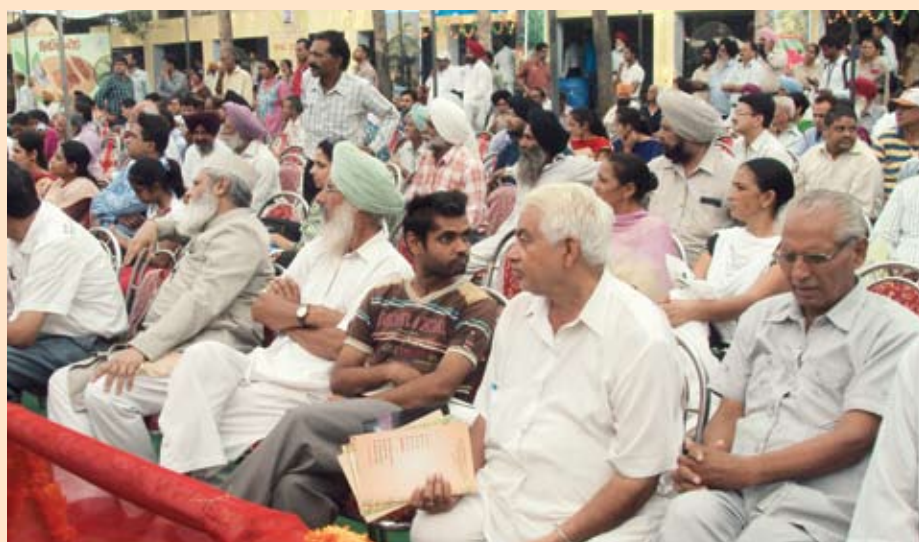
A view of audience at the inaugural function of Arogya fair organized by Department of AYUSH and the Government of Punjab at Garhdiwala tehsil of Hoshiarpur district during 5-6 October.

Mrs. Santosh Chowdhary, Minister of State for Health & Family