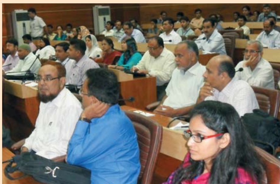
A view of a section of audience at the Council's National Conference on Managing Information Resources in Digital Environment held in New Delhi on 21 September.

He further said that the conference addressed all the issues related to digitization and offered new ideas about information management.