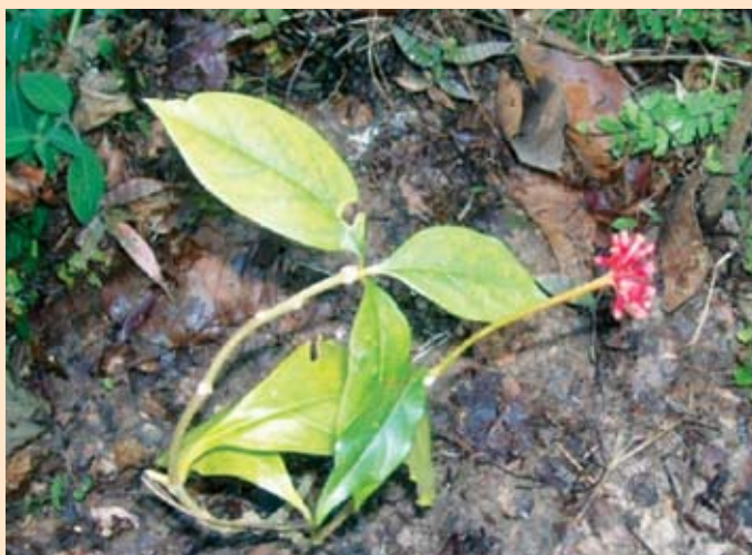
Asrol ( Rauvolfia serpentina (L.) Benth. ex Kurz)