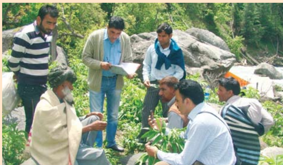
The Surveyors collecting folk claims from tribal inhabitants in Naranag forest area.

The survey team also collected seven folk claims about the plants used by the tribal and other rural inhabitants for treating different ailments. Some of these claims are: Rumex nepalensis Spreng (Oola) - leaves are used to treat pain and the root juice to cure chest congestion and cough; Arnebia benthami Wall. ex G. Don (Kahzaban) - for excessive