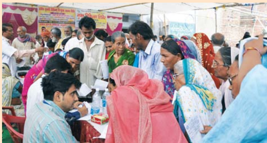
A view of the patients' crowd at the free health camp conducted by the Council's Regional Research Institute of Unani Medicine, Patna on 8 June in Isapur, Phulwari Sharif.