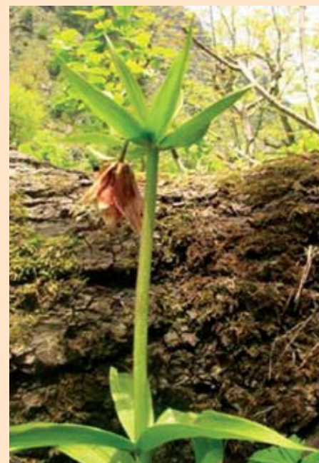
Shitkar ( Fritillaria roylei Hooker)

During the trip, the surveyors collected 78 botanical specimens belonging to 20 species. Some important medicinal plants including those used in Unani