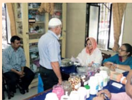
Patients waiting to get Unani medicines at the free health camp in Mumbai on 6 July.

T he RRIUM, Mumbai organized a free health camp in Mumbai on 6 July to screen patients for various research projects of the Institute.