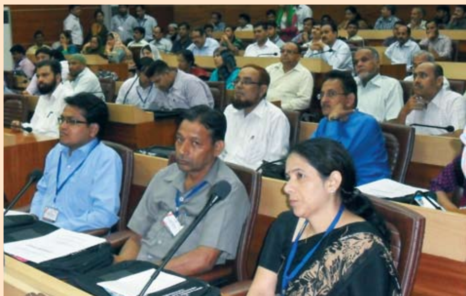
A view of audience at the inaugural session of National Conference on Managing Information Resources in Digital Environment held in New Delhi on 21 September.