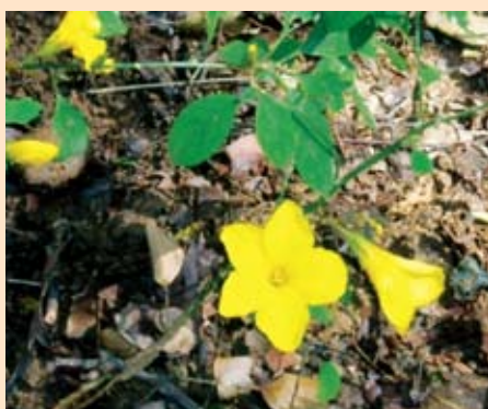
Piuli ( Reinwardtia indica Dumort.)