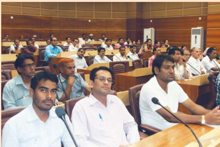
A view of audience at the inaugural function of Hindi Pakhwara organized by CCRUM at its headquarters in New Delhi on 6 September.

as the participants of competitions and all the employees of the Council.