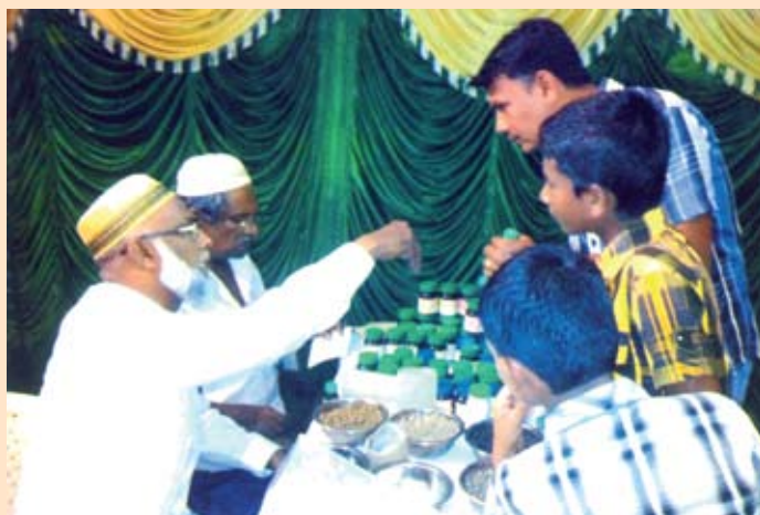
Unani physicians of RRIUM, Chennai explaining doses of medicines to patients at the free health camp organized by the Institute in Gummidipoondi, Chennai on 18 August.

For the camp held at Tondiarpet on 18 August, the RRIUM partnered with Manimegalai Amity Social Services, Chennai. The camp benefited 110 patients who were checked for various ailments and provided free-of-cost Unani treatment.