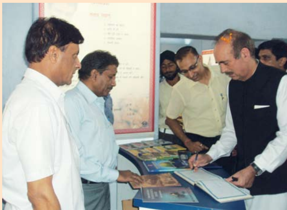
Mr. Ghulam Nabi Azad, Union Minister for Health & Family Welfare signing in the Visitors' Book at the pavilion of Central Council for Research in Unani Medicine on the inaugural day of Arogya fair in Garhdiwala tehsil of Hoshiarpur in Punjab.