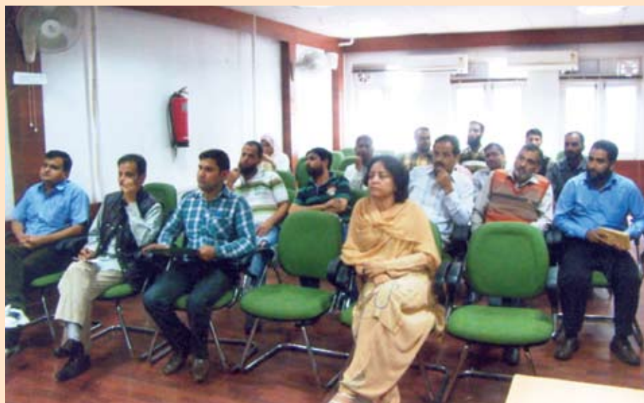
A view of audience at the prize distribution ceremony of Hindi Pakhwara held at the Council's Regional Research Institute of Unani Medicine, Srinagar on 7 October.